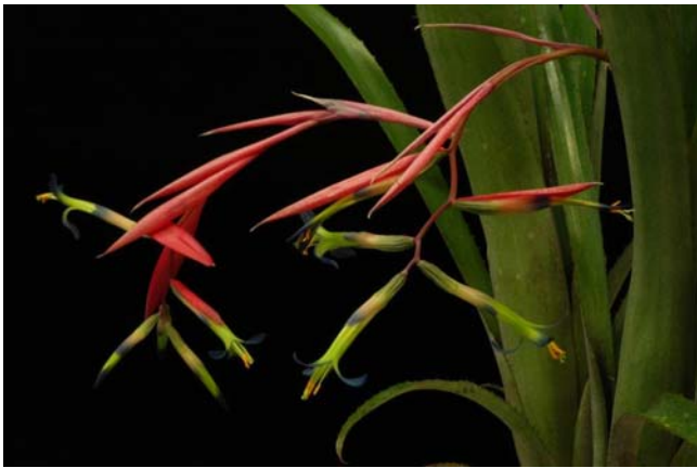
Fig. 8, 9 & 10 Billbergia 'Gouda's Glory'