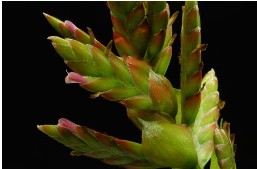
Fig. 4 & 5 Tillandsia latifolia , see Plant Portraits