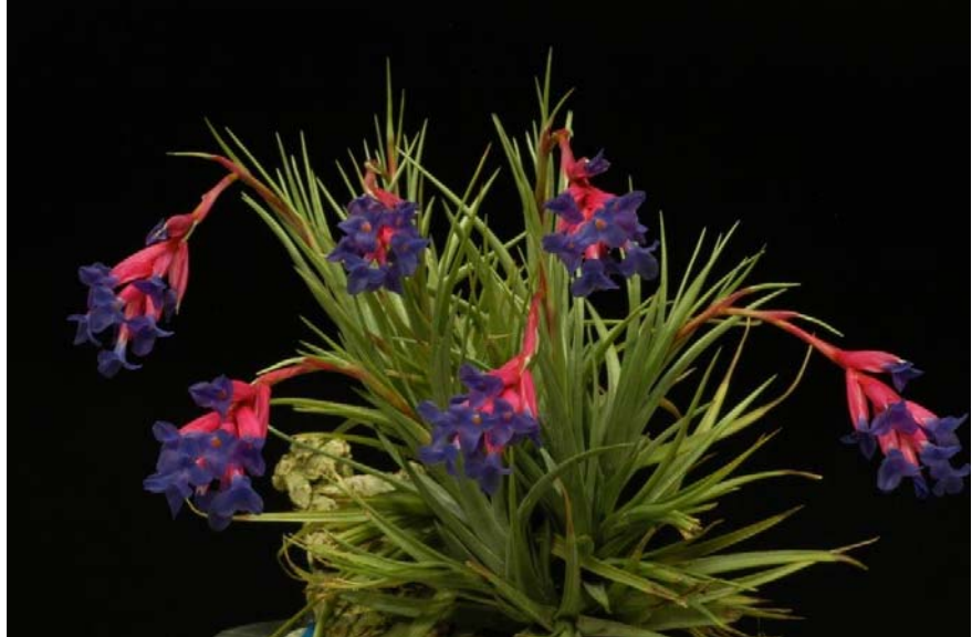
Fig. 6 & 7 Tillandsia aeranthos