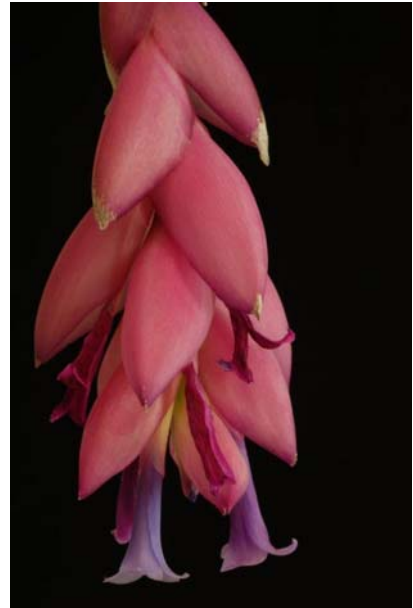
Fig. 1, 2 & 3 Tillandsia carminea, see Plant Portraits